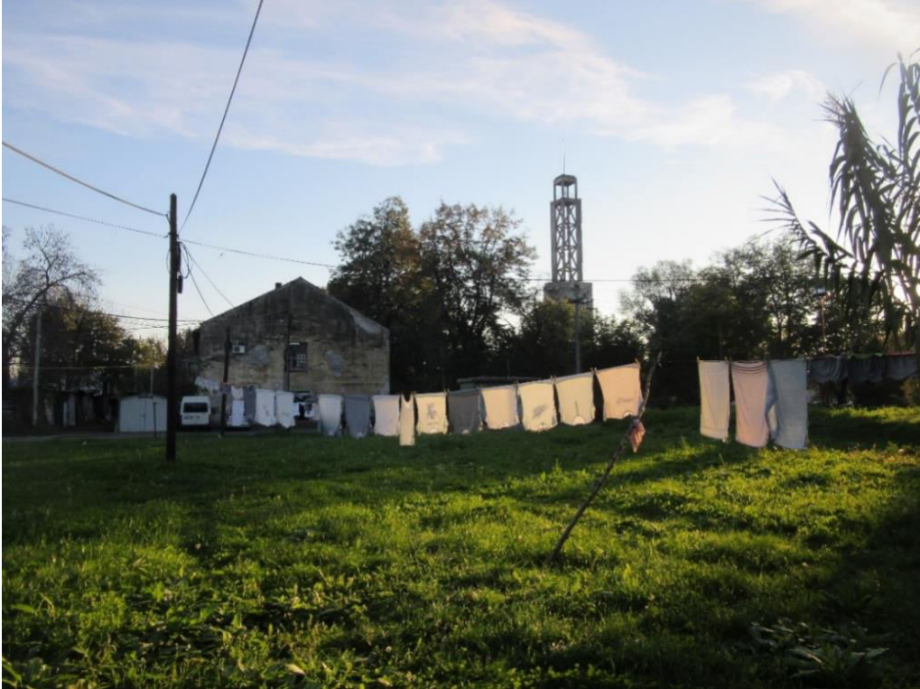
Figure 3. Old Belgrade Fairgrounds (Staro Sajmište). While the surrounding areas were remade into New Belgrade, the site of the Nazi concentration camp remained marginal in the post-war era.