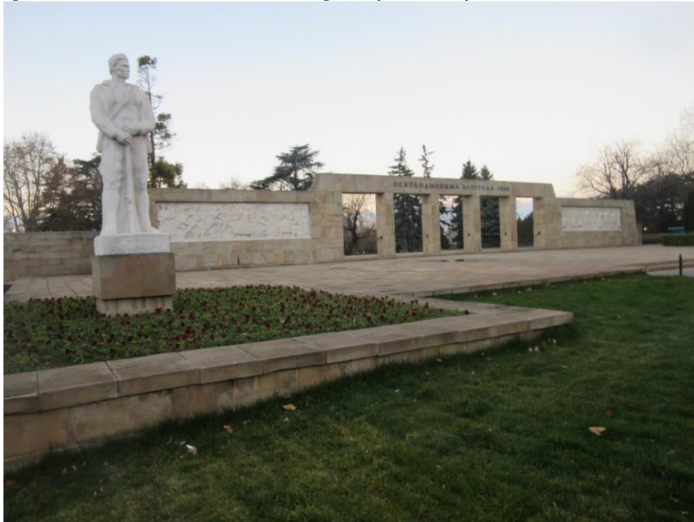
Figure 1. The monument to the liberators of Belgrade, by Novo Groblje.