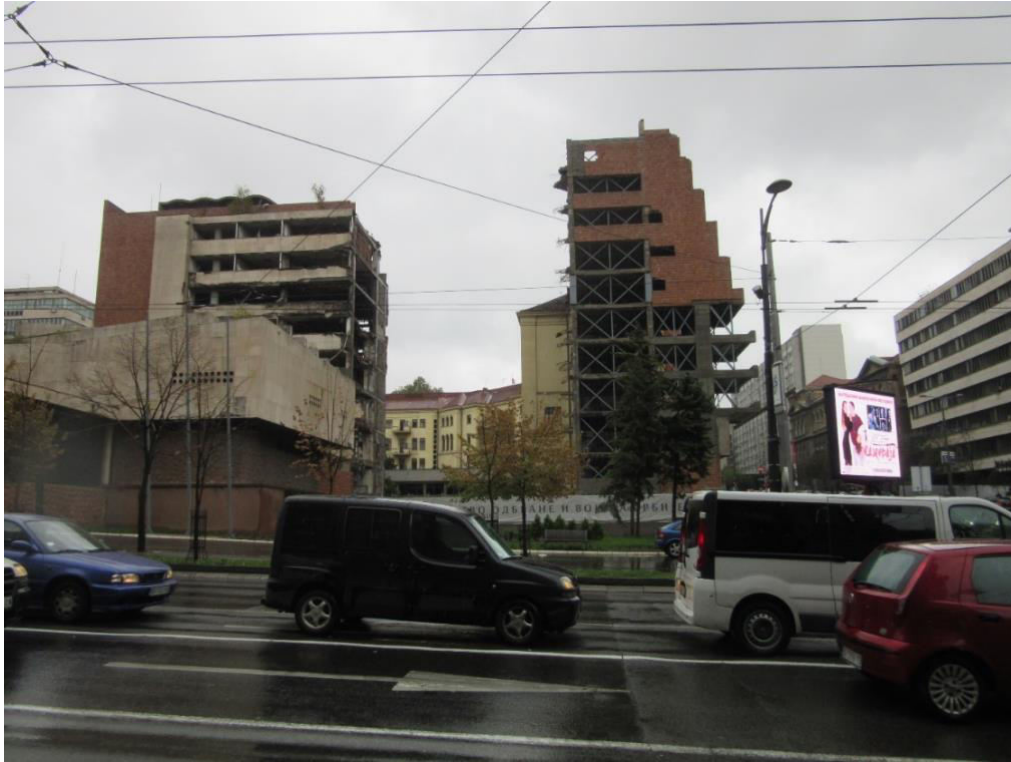
Figure 7. Generalštab, Building A, in 2016.