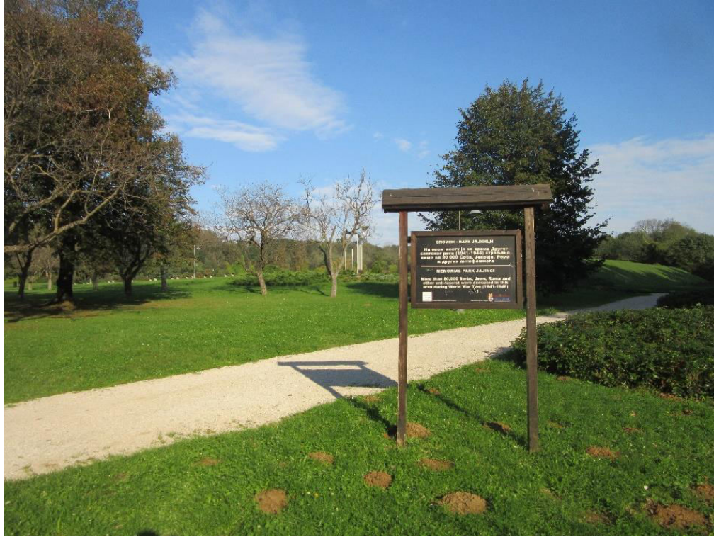
Figure 4. Jajinci Memorial Park