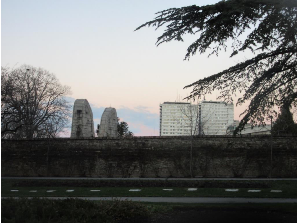
Figure 2. The arched tips of the Jewish memorial as seen from the memorial park dedicated to fallen soldiers.