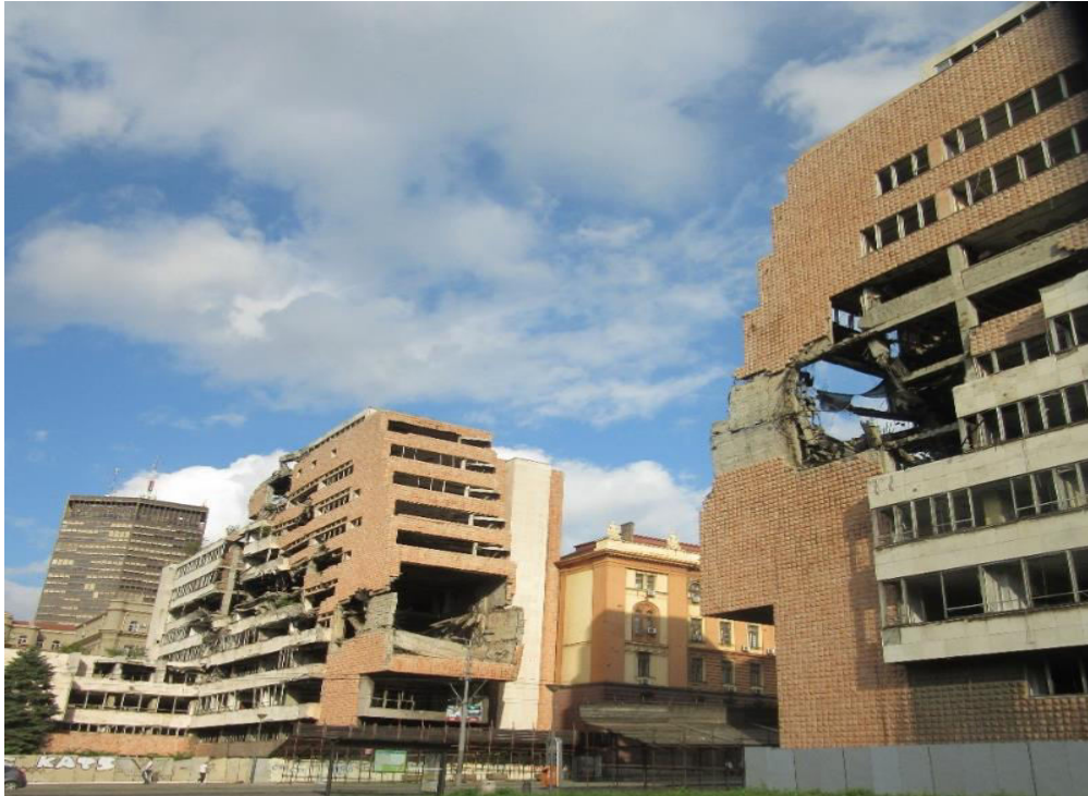
Figure 6. Ruins of Ministry of Defence of Yugoslavia and the General Staff of the Yugoslav Army (Generalštab). Building A (left), Building B (right) (2013)